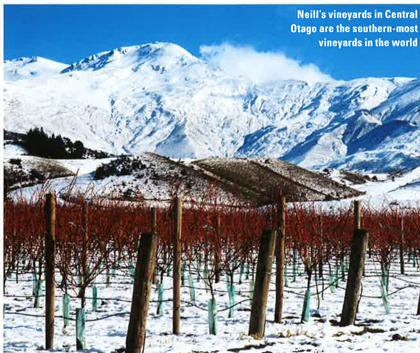
Neill's vineyards in Central Otago are the southern-most vineyards in the world

Be it one vineyard or another, and usually in the spring, God can point his finger and bomb one of the vineyards. But then it all goes right and you produce sublime wine. It is the last chance, you