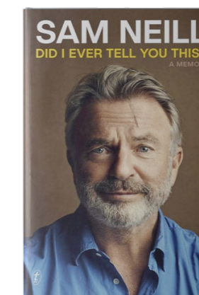
Did I Ever Tell You This? by Sir Sam Neill is available now.