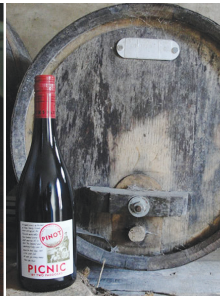
Picnic pinot noir