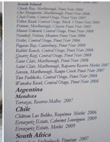
Two Paddocks on The Datai wine list